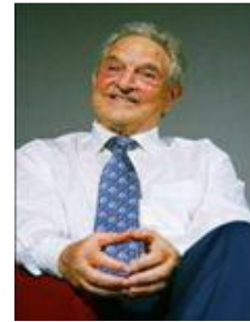
Would the mad billionaire George Soros run wild in an Obama White House?

So I am asking you to get Obama Unmasked and then tell at least five friends to get a copy as well – that's how we'll stop the Obama media machine from rolling right over an unsuspecting electorate.