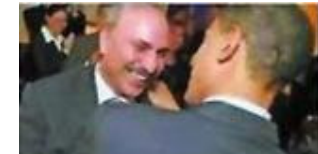
A dirty Chicago machine made Obama, and will be expecting blood loyalty...

So we're doing our best to make sure we're not stuck in an Obama nation. Can you help?