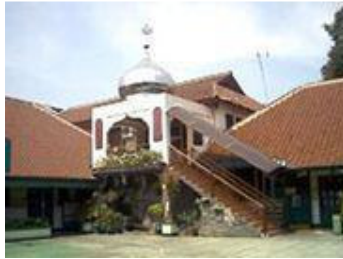
One of the Muslim schools Obama attended in Indonesia.

Back when he was an Illinois Senator, why did Obama vote "Present" a record-setting 130 times? Is that leadership? Is that "change"?