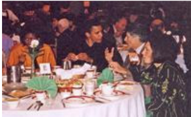
Obama with Arafat Advisor Edward Said at an anti-Israel fundraiser.

By his own account, Obama would consider it a priority to meet at once with every evil thug out there – without precondition.